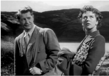
Powell & Pressburger, I Know Where I'm Going! , film still, 1945.

Eastbourne is coming ALIVE on Thursday nights this season. Join us on the first Thursday of every month as we throw open our doors until 9pm for a twilight gallery experience alongside talks, live music and networking. See our website for more details or #SouthEastCreatives