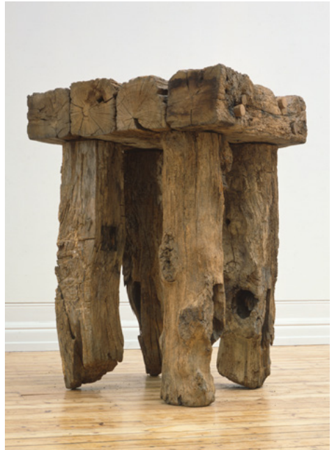
David Nash, Ancient Table, 1990.

See towner.gallery/halfterm for further events planned for the October 2019 half-term.