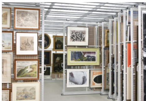
Towner Collection, 2019.

Learn more about the technical process and social context behind the series, an ideal add-on for anyone visiting Towner for the Ink, Paper & Print Fair on the same day.