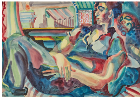
Kathleen Walne, Reclining Boy , 1935. © The Artist's Estate