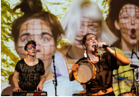
Charismatic Megafauna, Towner, 2019.