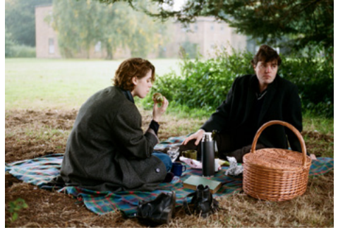
Joanna Hogg, The Souvenir , film still, 2019.

Eastbourne & Lewes Walking Festival takes place from Friday 20 September - Sunday 29 September 2019. This year, we are running a series of talks, events and screenings that explore the relationship between art, walking and the landscape. Learn more at towner.gallery/walkingfest